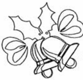
[HOLIDAY] CHRISTMAS BELLS

Sweet Thoughts from (INDIVIDUAL'S NAME) Kitchen