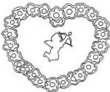
[HOLIDAY] VALENTINE'S DAY