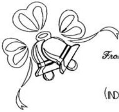
WEDDING BELLS #1