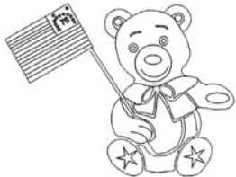
[HOLIDAY] 4TH OF JULY